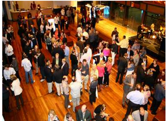
Everyone enjoying themselves at the "Meet and Greet" session