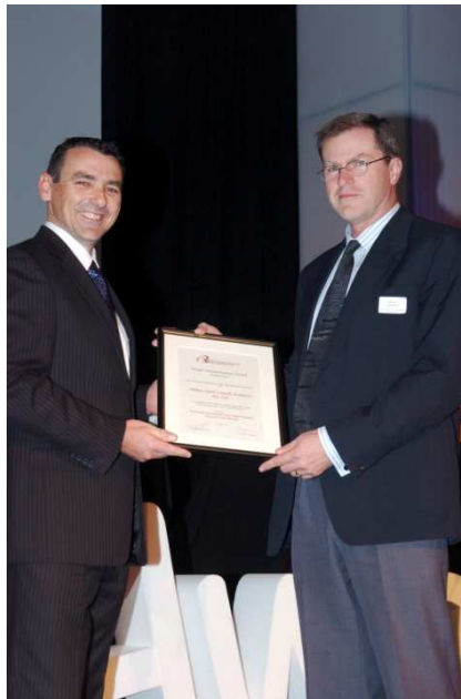
QISD Architectural Design Documentation Award winner Phillips Smith Conwell Architects Pty Ltd for: Townsville Correctional Centre Redevelopment Detention unit Block