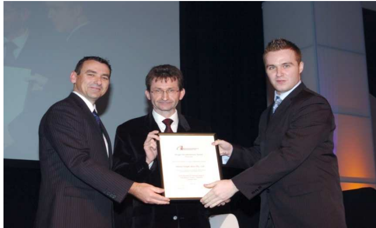
QISD Structural Design Documentation Award winner Sinclair Knight Merz Pty Ltd for: Boral Plasterboard manufacturing & Distribution Facility – Pinkenba Gypsum Store